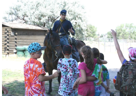
Re-enactors bring history to life for young visitors.