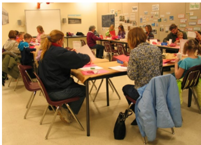
Fremont Family Fundays are the Museum's monthly hands-on history programs for all ages.