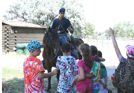
Re-enactors bring history to life for young visitors.

Contact the Museum Staff for more details: 307-235-8462 or ftcaspar@casperwy.gov