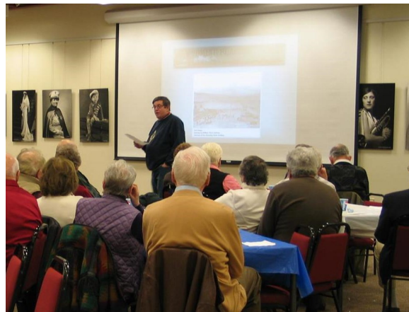
Lunch & Learn programs are held several times a year.